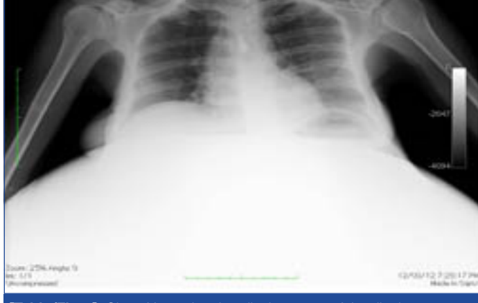
[Table/Fig-1]: Chest X-ray showing displacement of the diaphragm

Surgery was performed in the left lateral position and encysted mass was removed in total, which weighed 56.9 kg. Following the removal of the mass, there was a sudden fall in blood pressure to 70 mmHg systolic. There was considerable blood loss from the abdominal wall, with an estimated blood loss of 900 ml. The patient was resuscitated with crystalloids, 3 units of packed cells, and fresh frozen plasma. As the blood pressure did not improve despite fluid resuscitation, dopamine was started at15 mcg/kg/min, and it was then tapered